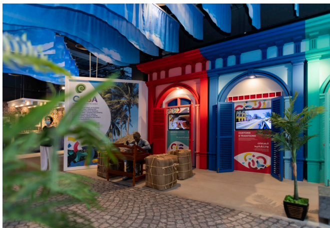
Cuba’s area at the Dubai Expo 2020.

In most cases, host countries pay Cuba directly with public funds. However, Cuba also enters into tripartite “collaboration” or triangulation agreements by which third party governments and international organizations—including WHO, the United Nations International Children’s Emergency Fund (UNICEF), and the Pan American Health Organization (PAHO)—pay for Cuba’s health services to underdeveloped countries. 137 By example, Cuba has received financial assistance for its medical missions in