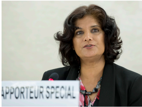
Urmila Bhoola, Special Rapporteur on contemporary forms of slavery, including its causes and consequences, during the 30th regular session at the Human Rights Council, 14 September 2015.