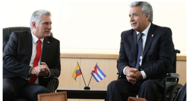
Moreno and Diaz Canel meeting at the UN HQ in New York.