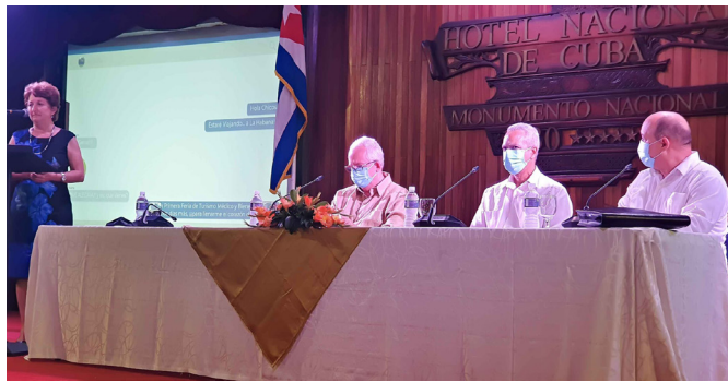
Announcement of the First International Fair of Medical and Wellness Tourism.

Honduras, Haiti, Niger, Rwanda, and Mali from the governments of Germany, France, Japan, Norway, and Australia. 138 During the 2014 Ebola epidemic, WHO financed Cuba’s medical missions to Liberia and Sierra Leone. 139 From 2013 to 2018, PAHO charged a 5% fee to serve as an intermediary for Brazil’s Mais Medicos program, an agreement that earned Cuba $400 million per year. 140