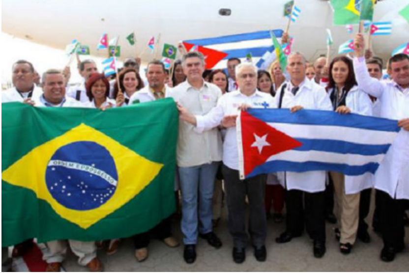
Cuban doctors hold Brazilian and Cuban flags as they arrive in Brazil to be part of the 'Mais Medicos' program in the country.

In 2013, Cuba created the Mais Medicos program with Brazil. While Cuba had medical programs in 60 other countries, its agreement with Brazil was one of the largest and most profitable, serving as a link between the cash-strapped island and South America's largest economy. 64 When Jair Bolsonaro was elected as president of Brazil in 2018, he ended the Mais Medicos program. President Bolsonaro announced the program could only continue if Cuban doctors directly received their salaries