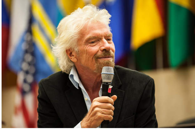
Richard Branson.