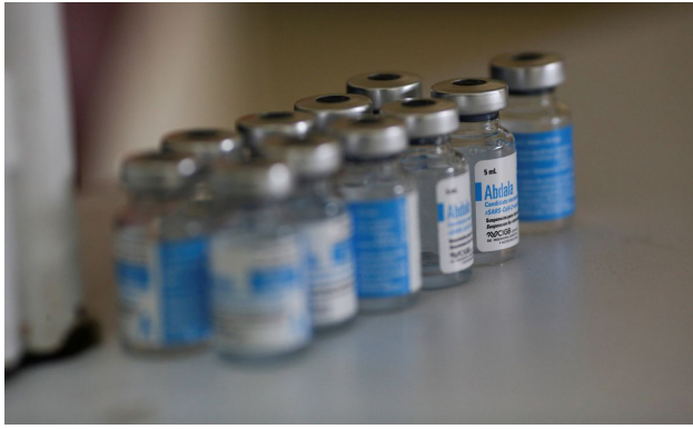
Doses of Cuba's Abdala coronavirus disease (COVID-19) vaccine are seen at a vaccination center in Caracas, Venezuela July 1, 2021.

Vietnam. 76 Cuba has said that they could produce 120 to 200 million doses a year, which could generate gross income of $600 million to $1 billion for the island's regime. 77