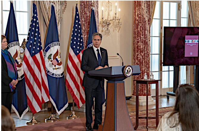
Secretary Antony J. Blinken at the 2021 Trafficking in Persons (TIP) Report Launch Ceremony.

The incorporation of a human rights-based approach in the Palermo Protocol and other “soft law” instruments acknowledges that all forms of human trafficking are indeed human rights violations. It changes the way states should approach anti-trafficking efforts, integrating human rights into their analysis of the problem and their responses. Identifying human trafficking as a human rights violation also triggers state obligations under binding human rights treaties. Crucially, a human rights-based approach can potentially expand the focus of human trafficking from criminal justice and crime