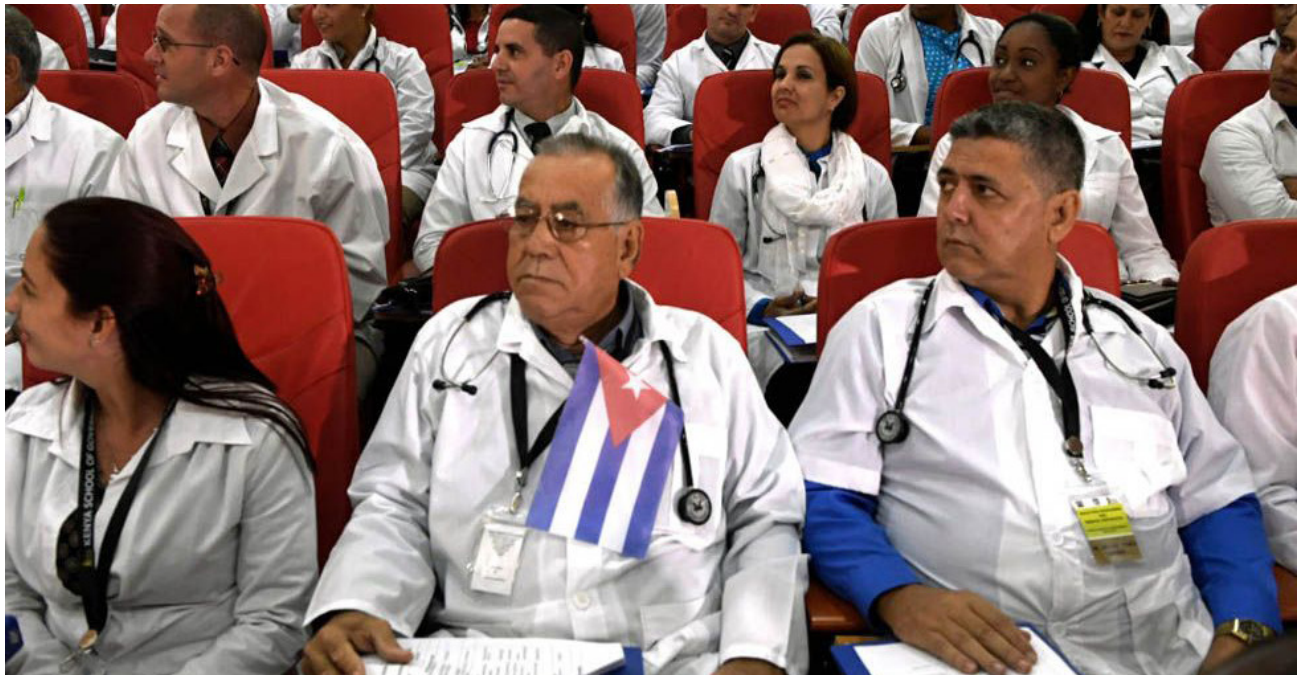
Cuban doctors attending a conference in Kenya.

In the following brief, we (1) present the legal instruments (international treaties and "soft law" norms) that call on states to protect the rights of human trafficking victims and incorporate a human rights approach to human trafficking solutions; (2) provide background information regarding the development of Cuba's medical missions; (3) outline the main coercive mechanisms Cuba uses to exploit the labor of its healthcare workers; (4) describe the role of the medical missions as "money-making" operations benefiting the Cuban regime; and (5) present a conclusion on the prior findings and suggest policy changes.