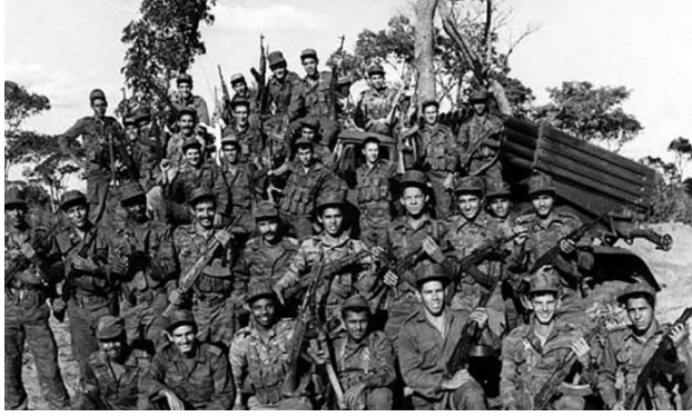
Cuban soldiers in Angola.

Cuba's brand of "medical internationalism" began in the 1960s with Cuba sending doctors to Algeria during its war with France. 57 Between 1966 and 1974, Cuba expanded its nascent medical missions program and sent doctors to work in Guinea-Bissau in support of its liberation struggle against Portugal. When Guinean President Amílcar Cabral requested Cuban assistance, the island sent a small military contingent to the region, along with a 31-member medical brigade. 58 In 1975, Cuba embarked on its largest military campaign in Africa, sending combat troops to Angola in support of the communist-aligned People's Movement for the Liberation of Angola and providing doctors alongside its military aid. 59