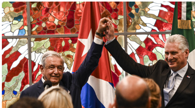
Cuban President Miguel Diaz Canel, right, and his Mexican counterpart Andres Manuel Lopez Obrador, left, raise their arms during a ceremony to award the Jose Marti order to President Lopez Obrador, at Revolution Palace in Havana, Cuba, Sunday, May 8, 2022.

This combination of international support and financial exploitation has prevented the Cuban government from facing widespread condemnation from the international community and adopting structural reforms to end human trafficking. As a result, stopping human trafficking in Cuba's medical missions will require a complex response that addresses all contributing factors that permit the exploitation of medical workers.