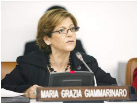
Maria Grazia Giammarinaro, Special Rapporteur on trafficking in persons, especially in women and children.

In the case of Cuba, intergovernmental organizations and foreign governments have denounced state-sponsored human trafficking in Cuba's medical missions. For instance, in the 2018 UN Universal Periodic Review of Cuba, the U.K. recommended the island to "[c]riminalize all forms of human trafficking [...] and address coercive elements of Cuban labour practices and foreign medical missions." 42 In September 2019, the U.S. Department of State announced visa restrictions on Cuban officials engaged in "exploitative and coercive labor practices" in the medical missions program. 43 Also, in November 2019, Ms. Urmila Bhoola (UN Special Rapporteur on contemporary forms of slavery, including its causes and consequences) and Ms. Maria Grazia Giammarinaro (UN Special Rapporteur on trafficking in persons, especially in women and children) sent a letter to the Cuban government, stating that the working conditions reported to them "from first-hand sources" could amount to forced labor. 44 Moreover, the 2021 TIP Report found that there is a "government policy or government pattern" in Cuba to profit from labor export programs with strong indications of forced labor, particularly in Cuba's medical missions. 45