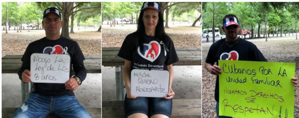
No Somos Desertores supporters holding up signs of the 8 year ban. "Médicos cubanos exigen que se les permita viajar a la Isla"

It is important to note that it is an accepted principle of international law that treaties apply to all individuals within a state's jurisdiction, including non-citizens. 111 As such, we can argue that host countries also have human rights obligations to all individuals living in their territory, including Cuban medical workers. The International Covenant on Civil and Political Rights (ICCPR), 112 which most host countries have ratified, protects the rights to freedom of expression and association, liberty, and movement. The International Covenant on Economic and Social Rights (ICESCR), 113 which recognizes the right to just and favorable conditions of work and to an adequate standard of living, enjoys almost universal ratification. Equally important, the Universal Declaration of Human Rights 114 contains freedom of speech and movement protections, including the right of all individuals "to leave any country" and to return to their birth country. As a result, host countries have an international law obligation to prohibit Resolution No. 168 from taking place in their territories, ensuring effective anti-trafficking and human rights protections for Cuban doctors.