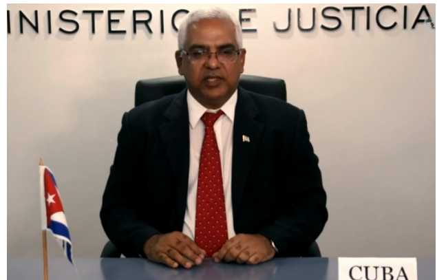
Minister of Justice Oscar Silvera Martínez's pre-recorded statement at the General Assembly.

Cuban doctors also face state-imposed burdens to secure independent labor contracts abroad. Cuba requires doctors to have special permission to leave the country. 81 The Ministry of Health often refuses to issue proof of the educational credentials of health professionals. In November 2018, the Cuban government issued additional restrictions regarding issuance of educational credentials, prohibiting the legalization of academic or other types of documents for health professionals serving in missions or attending international events. 82 This tactic renders Cuban doctors unable to demonstrate their qualifications to practice outside Cuba. As a result, their only option to work overseas is through the government’s medical missions.