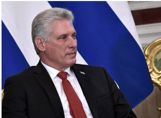
Miguel Diaz-Canel in negotiations with President Putin, November 2, 2018.

The information presented in this brief demonstrates that the Cuban government has engaged with impunity in state-sponsored human trafficking that violates Cuba's international law obligations. Cuba's totalitarian regime has used its disproportionate power over medical professionals and their conditions of employment to exploit and abuse healthcare workers through myriad coercive mechanisms, ranging from threat of family separation and forced exile to movement restrictions and wage theft. Cuban doctors fear their refusal to participate in the medical missions will generate reprisals from the government,