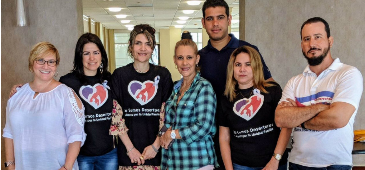
Cuban doctors gathered in Miami.

Medical workers subject to Migration Law 1312 who have tried to enter Cuba have received inadmissibility documents at customs and have been immediately deported. 118 Members of the group No Somos Desertores 119 have reported that the Cuban government has prevented them from entering the island for emergencies and funerals of relatives because they have “abandoned” medical missions or overstayed their assignments. 120