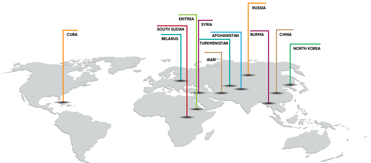
Governments with a “policy or pattern” of human trafficking according to the 2020 TIP

In 2019, the U.S. Congress amended the TVPA to note that governments can show a “policy or pattern” of human trafficking. This amendment recognizes state-sponsored human trafficking in government-funded programs, specifically forced labor in government-affiliated medical services such as Cuba’s medical missions. 38 Although the TVPA already considers whether government officials “participated in, facilitated, condoned, or were otherwise complicit in trafficking” when deciding tier rankings, the 2019 amendment directly connects government-sponsored human trafficking to a Tier 3 ranking. 39 In fact, the 2020 TIP Report marked the first time the U.S. Department of State applied this new legal provision, finding that the following governments had a “policy or pattern” of human trafficking: Afghanistan, Belarus, Burma, China, Cuba, Eritrea, Iran, North Korea, Russia, South Sudan, Syria, and Turkmenistan. 40 The 2021 TIP Report equally determined that all previous states (except Belarus) have an ongoing documented “policy or pattern” of human trafficking, trafficking in government-funded programs, forced labor in government-affiliated medical services, sexual slavery, or the recruitment of child soldiers. 41