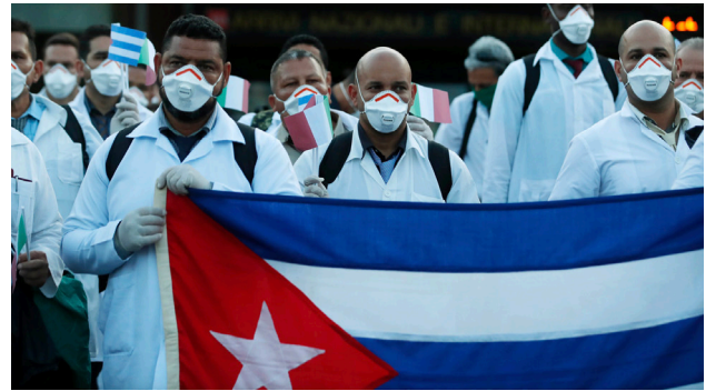
Medics and paramedics from Cuba pose upon arrival at the Malpensa airport of Milan, Italy, Sunday, March 22, 2020. Fifty-three doctors and paramedics from Cuba arrived in Milan to help with coronavirus treatment.

The pandemic has also allowed Cuba to revitalize its medical missions program and propa-