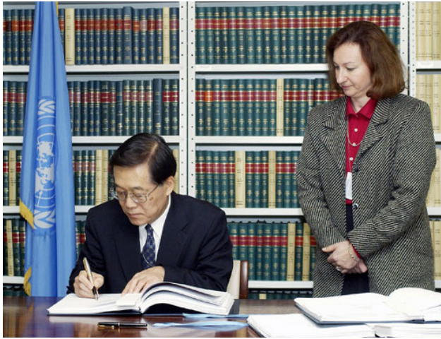
Signing ceremony of the Palermo Protocol, 9 December 2002.

While the Palermo Protocol's anti-trafficking provisions are clear, gaps exist in the incorporation of human rights protections for the victims of human trafficking. According to Article 5 of the Protocol, states must criminalize human trafficking and establish domestic anti-trafficking laws. This emphasis on a criminal justice framework means that in practice most states address human trafficking from a criminal perspective, rather than incorporating a human rights-based approach. However, in addition to this criminal justice provision, the Protocol includes human rights obligations. According to Article 2(b), the Protocol is intended to "protect and assist the victims [...] with full respect for their