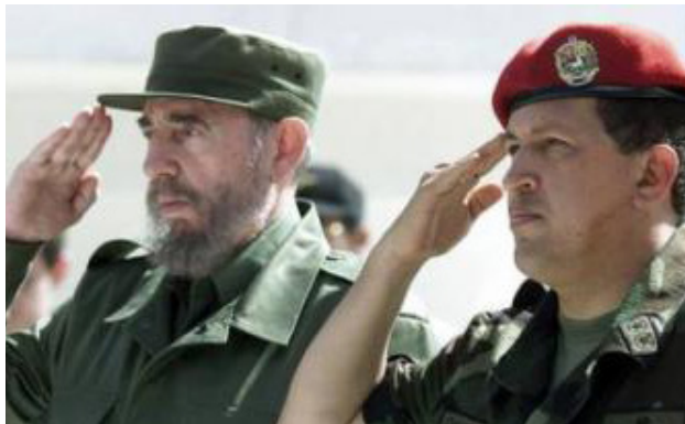
Fidel Castro and Hugo Chavez

The Cuban government's efforts to expand its medical missions program continued throughout the mid-2000s through structural changes in the island's healthcare system. In 2010, the Ministry of Health announced a personnel reduction in the domestic healthcare sector so that more doctors could be sent abroad "to earn hard currency." 62 In 2011, the Cuban government also carried out a series of privatization measures following the Russian model to make the state-owned economy fit into a free-market world. As a result, Cuba created the Comercializadora de Servicios Médicos Cubanos, S.A., the corporation that took over the business of exporting health personnel. Through this entity and thanks to the alliance with Venezuela, it was possible to export Cuban health-care labor on a massive scale. 63