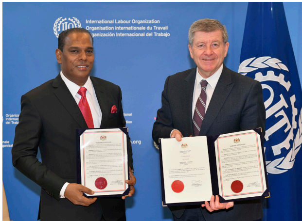
Cuban official giving declarations related to the Forced Labour Convention.

The International Labour Organization's (ILO) Forced Labour Convention, 1930 (No. 29), defines forced labor as "all work or service which is exacted from any person" under the threat of penalty and "for which the person has not offered himself or herself voluntarily." 22 This definition consists of three legal elements: (1) work or service (all work arising in any activity, industry, or sector); (2) penalty (no specific activity is required); and (3) involuntariness (absence of free and informed consent and freedom to leave a job). 23 The TVPA contains a similar definition of forced labor. 24 Certain conditions—including compulsory military service,