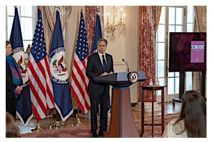
Secretary Antony J. Blinken at the 2021 Trafficking in Persons (TIP) Report

The incorporation of a human rights-based approach in the Palermo Protocol and other "soft law" instruments acknowledges that all forms of human trafficking are indeed human rights violations. It changes the way states should approach anti-trafficking efforts, integrating human rights into their analysis of the problem and their responses. Identifying human trafficking as a human rights violation also triggers state obligations under binding human rights treaties. Crucially, a human rights-based approach can potentially expand the focus of human trafficking from criminal justice and crime