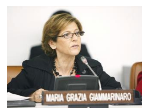
Maria Grazia Giammarinaro, Special Rapporteur on trafficking in persons, especially in women and children.

In the case of Cuba, intergovernmental organizations and foreign governments have denounced state-sponsored human trafficking in Cuba's medical missions. For instance, in the 2018 UN Universal Periodic Review of Cuba, the U.K. recommended the island to "[c]riminalize all forms of human trafficking [...] and address coercive elements of Cuban labour practices and foreign medical missions."42 In September 2019, the U.S. Department of State announced visa restrictions on Cuban officials engaged in "exploitative and coercive labor practices" in the medical missions program.<sup>43</sup> Also, in November 2019, Ms. Urmila Bhoola (UN Special Rapporteur on contemporary forms of slavery, including its causes and consequences) and Ms. Maria Grazia Giammarinaro (UN Special Rapporteur on trafficking in persons, especially in women and children) sent a letter to the Cuban government, stating that the working conditions reported to them "from first-hand sources" could amount to forced labor. 44 Moreover, the 2021 TIP Report found that there is a "government policy or government pattern" in Cuba to profit from labor export programs with strong indications of forced labor, particularly in Cuba's medical missions.<sup>45</sup>