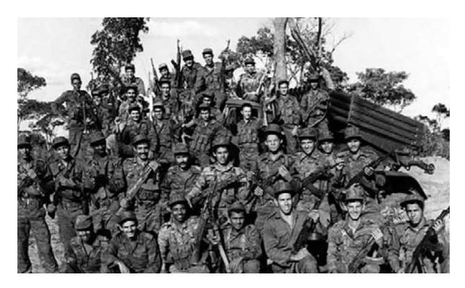
Cuban soldiers in Angola.

Cuba's brand of "medical internationalism" began in the 1960s with Cuba sending doctors to Algeria during its war with France. Between 1966 and 1974, Cuba expanded its nascent medical missions program and sent doctors to work in Guinea-Bissau in support of its liberation struggle against Portugal. When Guinean President Amilcar Cabral requested Cuban assistance, the island sent a small military contingent to the region, along with a 31-member medical brigade. In 1975, Cuba embarked on its largest military cam-