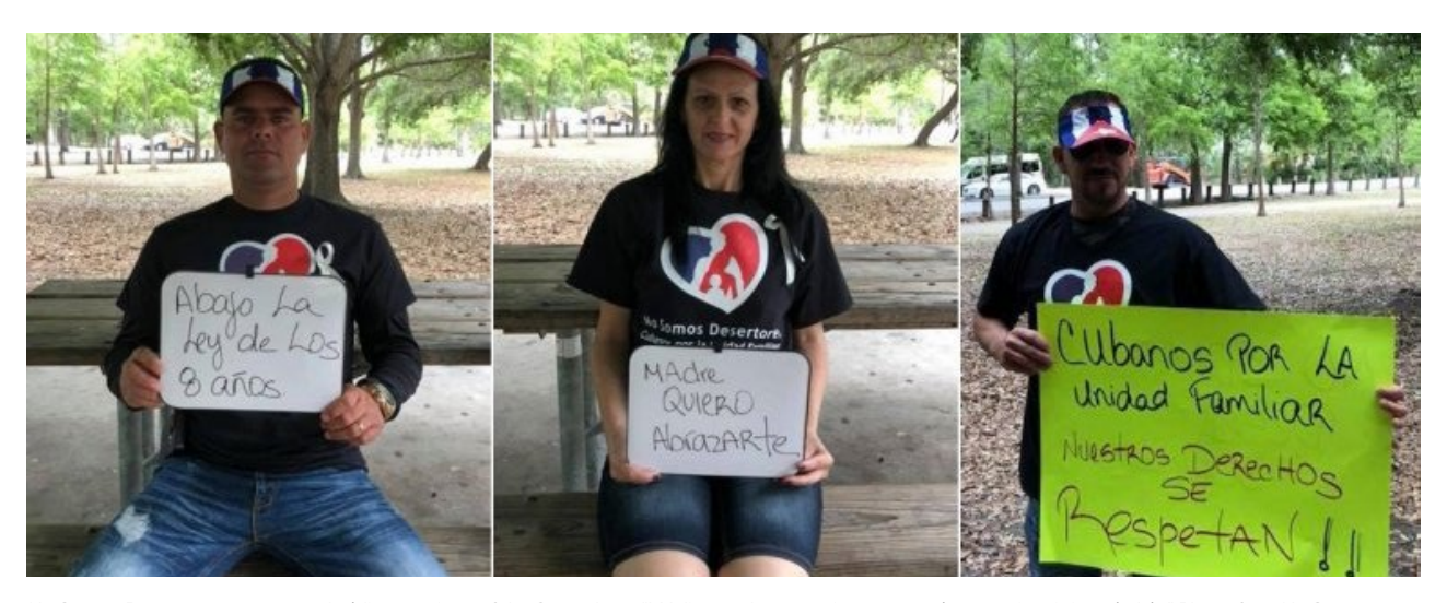
No Somos Desertores supporters holding up signs of the 8 year ban. "Médicos cubanos exigen que se les permita viajar a la Isla"

It is important to note that it is an accepted principle of international law that treaties apply to all individuals within a state's jurisdiction, including non-citizens. As such, we can argue that host countries also have human rights obligations to all individuals living in their territory, including Cuban medical workers. The International Covenant on Civil and Political Rights (ICCPR), Viii) which most host countries have ratified, protects the rights to freedom of expression and association, liberty, and movement. The International Covenant on Economic and Social Rights (ICESCR), Viiii) which recognizes the right to just and favorable conditions of work and to an adequate standard of living, enjoys almost universal ratification. Equally important, the Universal Declaration of Human Rights Contains freedom of speech and movement protections, including the right of all individuals "to leave any country" and to return to their birth country. As a result, host countries have an international law obligation to prohibit Resolution No. 168 from taking place in their territories, ensuring effective anti-trafficking and human rights protections for Cuban doctors.