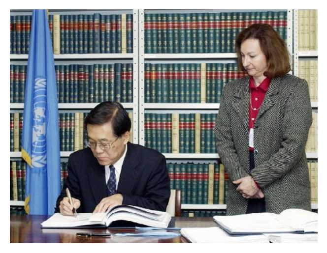
Signing ceremony of the Palermo Protocol, 9 December 2002.

While the Palermo Protocol's anti-trafficking provisions are clear, gaps exist in the incorporation of human rights protections for the victims of human trafficking. According to Article 5 of the Protocol, states must criminalize human trafficking and establish domestic anti-trafficking laws. This emphasis on a criminal justice framework means that in practice most states address human trafficking from a criminal perspective, rather than incorporating a human rights-based approach. However, in addition to this criminal justice provision, the Protocol includes human rights obligations. According to Article 2(b), the Protocol is intended to "protect and assist the victims [...] with full respect for their