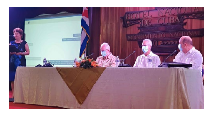
Announcement of the First International Fair of Medical and Wellness Tourism.

In most cases, host countries pay Cuba directly with public funds. However, Cuba also enters into tripartite "collaboration" or triangulation agreements by which third party governments and international organizations—including WHO, the United Nations International Children's Emergency Fund (UNICEF), and the Pan American Health Organization (PAHO)—pay for Cuba's health services to underdeveloped countries.<sup>137</sup> By example, Cuba has received financial assistance for its medical missions in