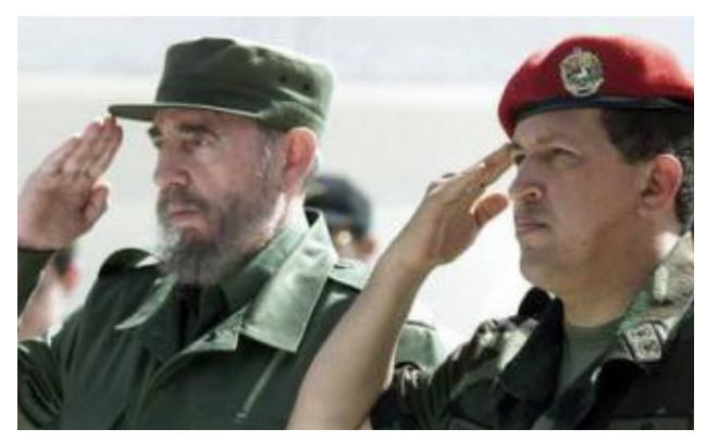
Fidel Castro and Hugo Chavez

The Cuban government's efforts to expand its medical missions program continued throughout the mid-2000s through structural changes in the island's healthcare system. In 2010, the Ministry of Health announced a personnel reduction in the domestic healthcare sector so that more doctors could be sent abroad "to earn