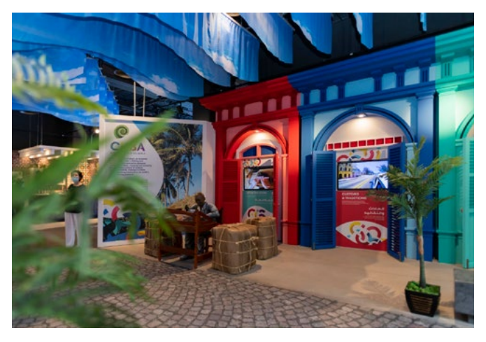
Cuba's area at the Dubai Expo 2020.

Honduras, Haiti, Niger, Rwanda, and Mali from the governments of Germany, France, Japan, Norway, and Australia.<sup>138</sup> During the 2014 Ebola epidemic, WHO financed Cuba's medical missions to Liberia and Sierra Leone.<sup>139</sup> From 2013 to 2018, PAHO charged a 5% fee to serve as an intermediary for Brazil's Mais Medicos program, an agreement that earned Cuba $400 million per year.<sup>140</sup>