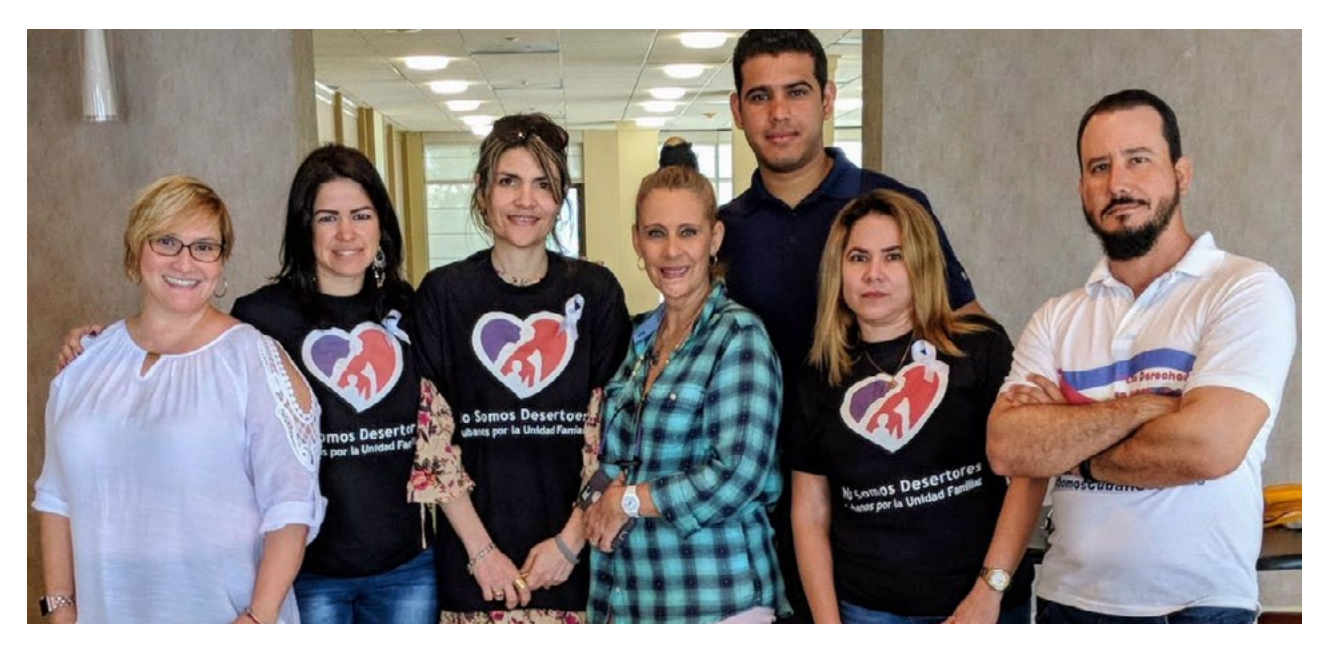
Cuban doctors gathered in Miami.

Medical workers subject to Migration Law 1312 who have tried to enter Cuba have received inadmissibility documents at customs and have been immediately deported. Members of the group No Somos Desertores have reported that the Cuban government has prevented them from entering the island for emergencies and funerals of relatives because they have "abandoned" medical missions or overstayed their assignments. Page 120 page 1312 who have tried to enter Cuba have received inadmissibility documents of the group No Somos Desertores 119 have reported that the Cuban government has prevented them from entering the island for emergencies and funerals of relatives because they have "abandoned" medical missions or overstayed their assignments.