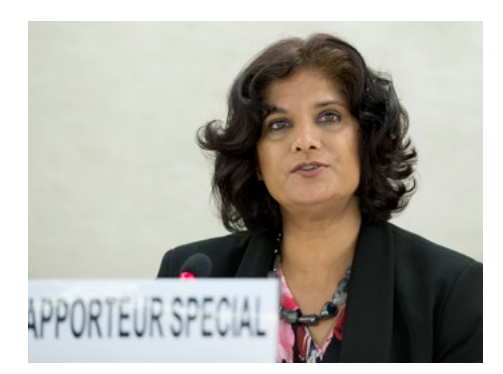
Urmila Bhoola, Special Rapporteur on contemporary forms of slavery, including its causes and consequences, during the 30th regular session at the Human Rights Council, 14 September 2015.