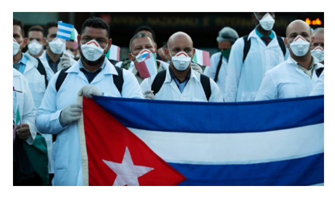
Medics and paramedics from Cuba pose upon arrival at the Malpensa airport of Milan, Italy, Sunday, March 22, 2020. Fifty-three doctors and paramedics from Cuba arrived in Milan to help with coronavirus treatment.

In addition to increasing the size of its medical missions, the Cuban government has been using its COVID-19 vaccine candidates to further capitalize on its medical missions. Cuba has submitted three COVID-19 vaccine candidates for Emergency Use Listing by the World Health Organization (WHO). The agency has not approved Cuba's vaccine candidates, noting it is "awaiting information on strategy and timelines for submission."<sup>73</sup>