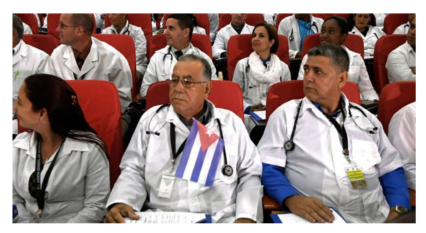
Cuban doctors attending a conference in Kenya.

In the following brief, we (1) present the legal instruments (international treaties and "soft law" norms) that call on states to protect the rights of human trafficking victims and incorporate a human rights approach to human trafficking solutions; (2) provide background information regarding the development of Cuba's medical missions; (3) outline the main coercive mechanisms Cuba uses to exploit the labor of its healthcare workers; (4) describe the role of the medical missions as "money-making" operations benefiting the Cuban regime; and (5) present a conclusion on the prior findings and suggest policy changes.