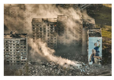
Smoke rises from a building in Bakhmut, site of the heaviest battles with the Russian troops in the Donetsk region of Ukraine.

Russian nationalists – all of it part of a broader package of policies. Call it, if you will, containment – a policy that helped hem in Soviet expansionism and could once more help to rein in an expansionist Moscow.