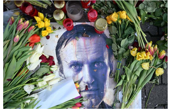
Flowers are seen placed around a portrait of late Russian opposition leader Alexei Navalny at a makeshift memorial in Frankfurt am Main, Germany, on Feb. 29

The past few weeks have seen an outpouring of both grief and tributes following the death of Russian opposition figure Alexei Navalny. And rightfully so. Navalny's death in a Siberian gulag effectively snuffed out what many viewed as the clearest path to Russia's eventual democratization.