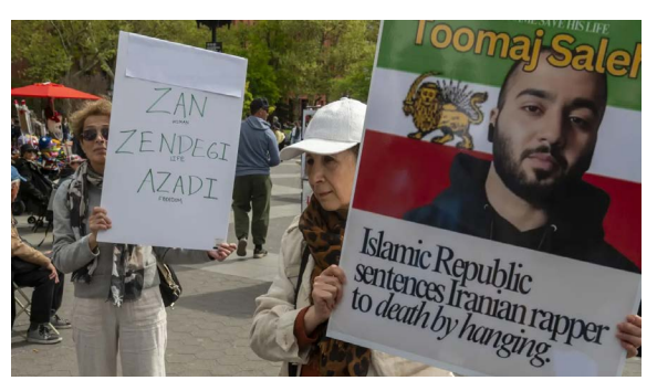
A protester holds a sign calling to free Toomaj Salehi during a protest in solidarity with the Iranian rapper, who was sentenced to death by courts in Iran for supporting the anti-government protest movement in Washington Square Park.

There's no length Iran won't go to <u>in order to quash dissent</u>. Murder included.