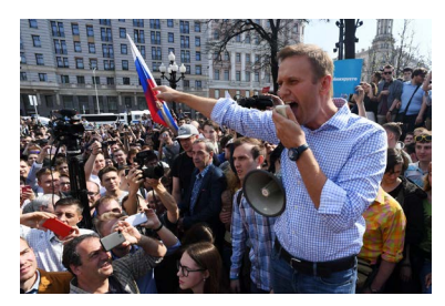
While Alexei Navalny may have been the most prominent leader of democratic movements in Russia, killing him will hardly eliminate pro-democratic energies in the country.

Why It Might Happen: As the anti-communist, anti-colonial revolutions in 1989 across Eastern Europe illustrated, totalitarian regimes can rest on quicksand and quickly crumble in the face of democratic movements. Putin's disastrous decision-making in Ukraine has already had unforeseen knock-on effects, which will only continue to generate discontent moving forward – and more interest in potential alternatives, including outright democracy.