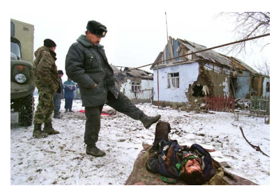
A Dagestan officer kicks the body of a Chechen fighter in the village of Pervomaiskaya after the Russian grueling assault on Jan. 19, 1996.

reform on – a belief that has <u>burned</u> the West in the past and that led the West to miss just how ingrained Russian imperialism still is.